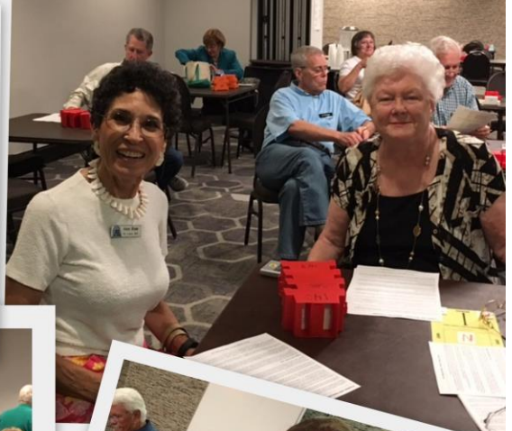
St. Louis Regional