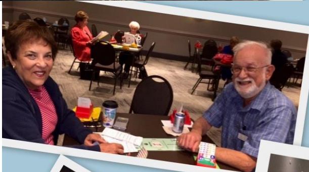
St. Louis Gateway to the West Regional