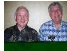
1st overall C