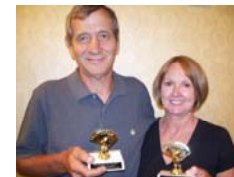
1 st Overall in C