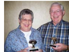
1st overall A & B