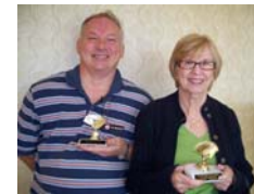
1 st Overall in A & B